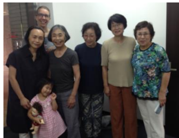
Thursday morning Bible study attendees

Every Wednesday night and Thursday morning I have the privilege of leading Bible studies for our church members. For the past year we have been studying Acts, learning about Peter's and Paul's commitment to the Great Commission, seeing the Holy Spirit at work in the early church and the lives of the believers, and learning a little geography along the way. We are encouraged and challenged by God's Word and each other each week.